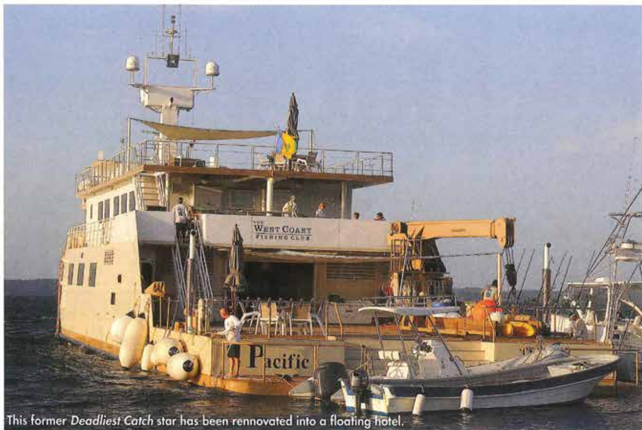
This former Deadliest Catch star has been renovated into a floating hotel.

ing philosophical again in their infinity pool. The chef on board just finished six years in a European culinary academy. If you are wondering if it shows in the cuisine...oh yes, yes, yes. It's been 50 years now that I've been destination fishing and I've been in some pretty rough spots. But this isn't one of them.