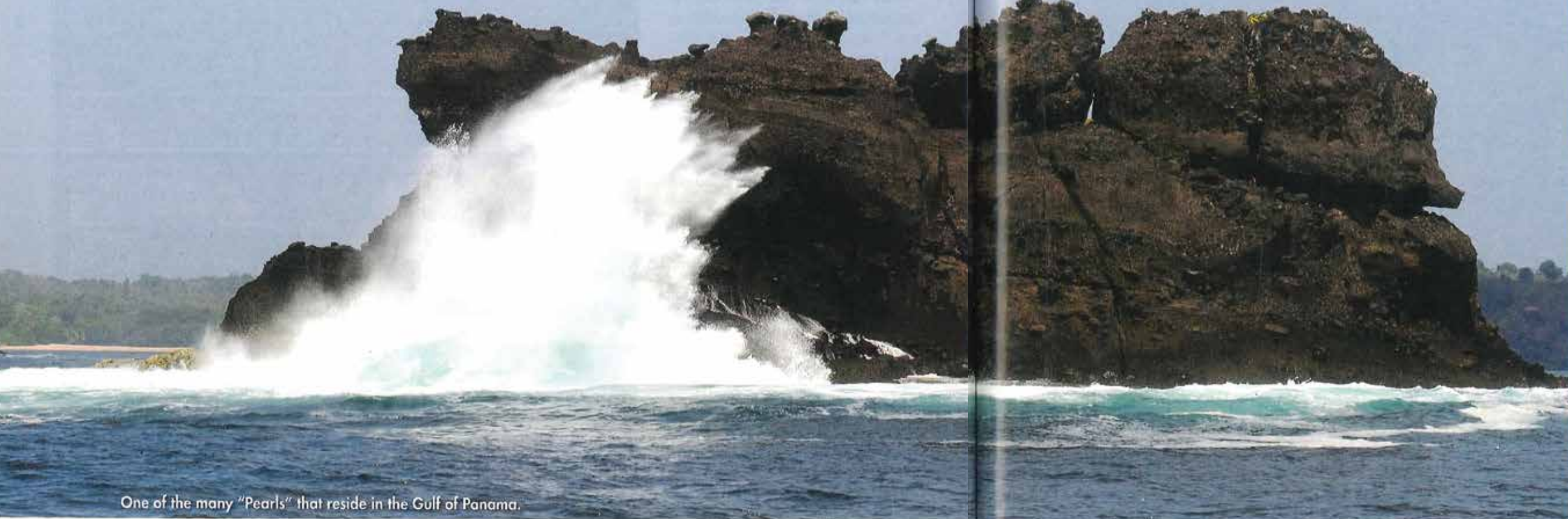
One of the many "Pearls" that reside in the Gulf of Panama.